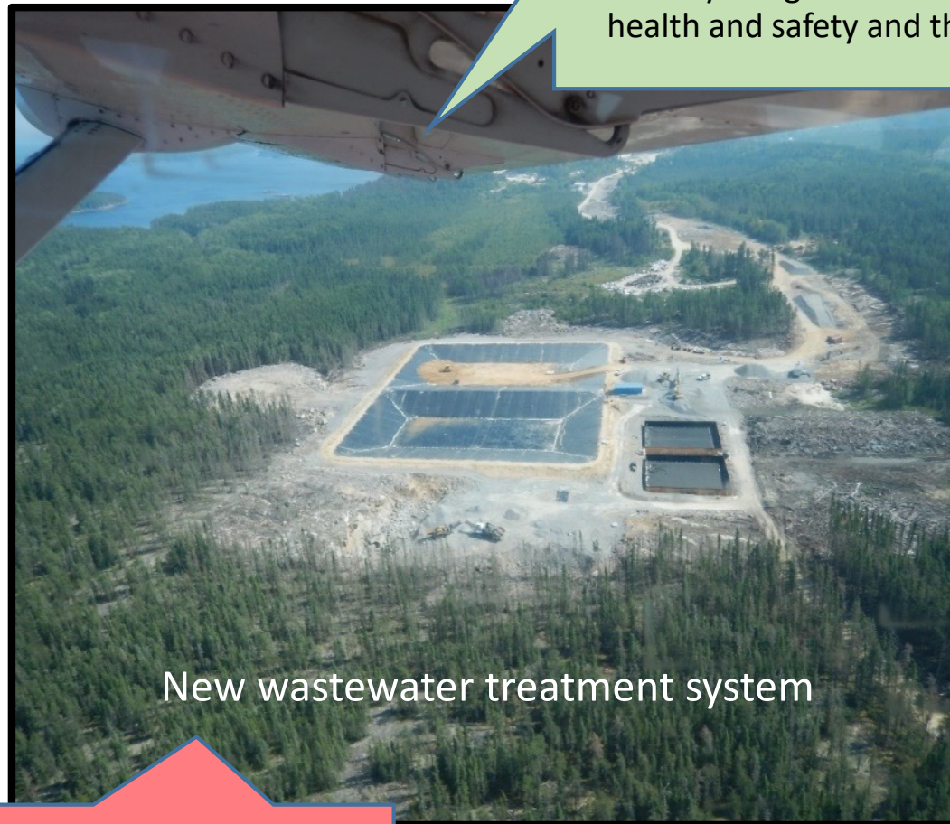
New wastewater treatment system