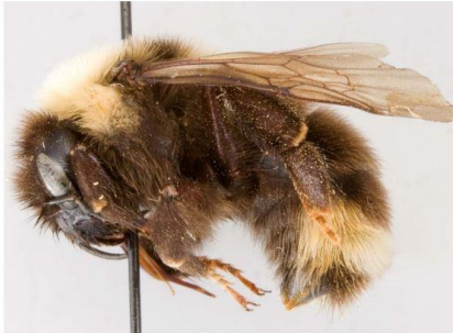
Female Gypsy Cuckoo Bumblebee by Sheila Colla