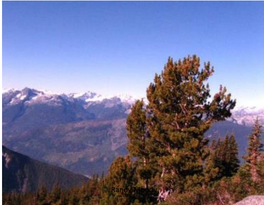
WHITEBARK PINE ( ENDANGERED )