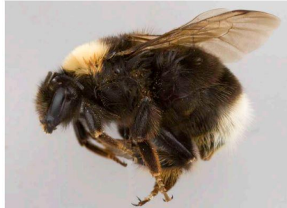
Female Western Bumble Bee ( occidentalis ) by Sheila Colla