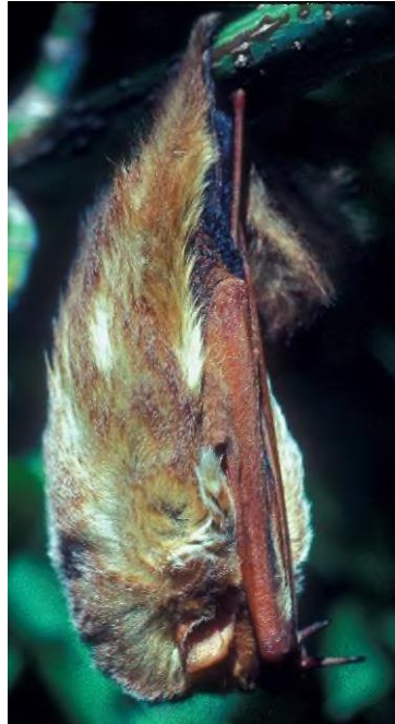
EASTERN RED BAT