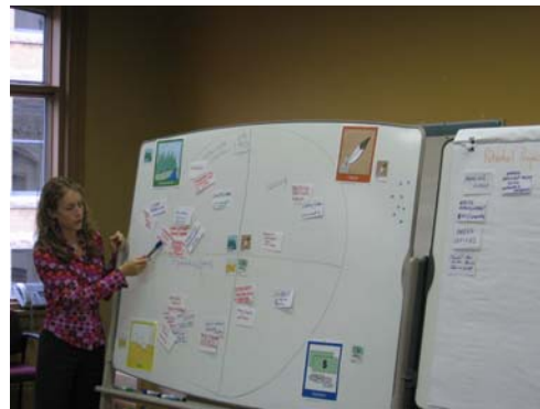
Looking for similarities Separating vision & project ideas