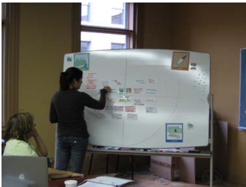
Vision Ideas & Sustainability

Sharing this draft vision with the leadership, the administration, Elders, youth, and the community is an important next step. You will probably get into discussions about the use of certain words, the way sentences are put together, using images and art as part of the vision – and more! This is a creative process and doesn't happen overnight. The input from these people will help you modify the vision to come up with something that the community supports and is excited about. Having a vision that is community based is essential and will guide the development of your plan and give it strength.