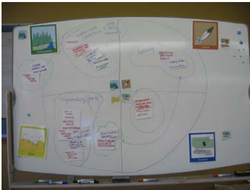
Creating themes for the vision